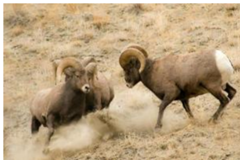
Males competing for the ability to mate

Competition - when organisms of the same or different species attempt to use the same ecological resource